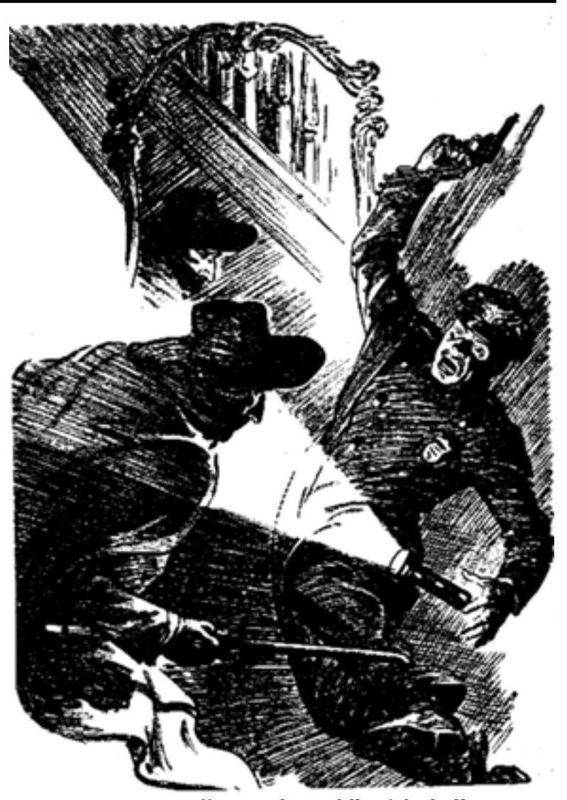
Meeting an officer in the middle of the hallway, The Shadow side-stepped and caught his adversary's ankle with the cane handle.

Headlights, faced the opposite direction, were hidden by the hedge as the limousine rolled away. Finished with their useless fusillade, the searchers came plunging through the hedge a little later; but, by then, the limousine's taillights had vanished in the distance.