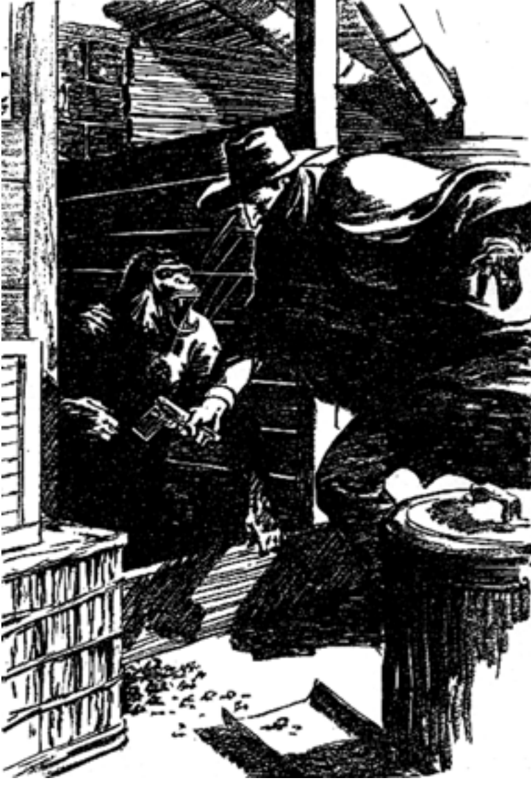
The Shadow was around the corner of the bin door, swinging his gun hand ahead of him, when a crouched figure lunged upward to meet him.

between them with a hard, downward stroke. He expected his adversary to dodge, which would have enabled The Shadow to pull the sledging blow and merely stun his foeman.